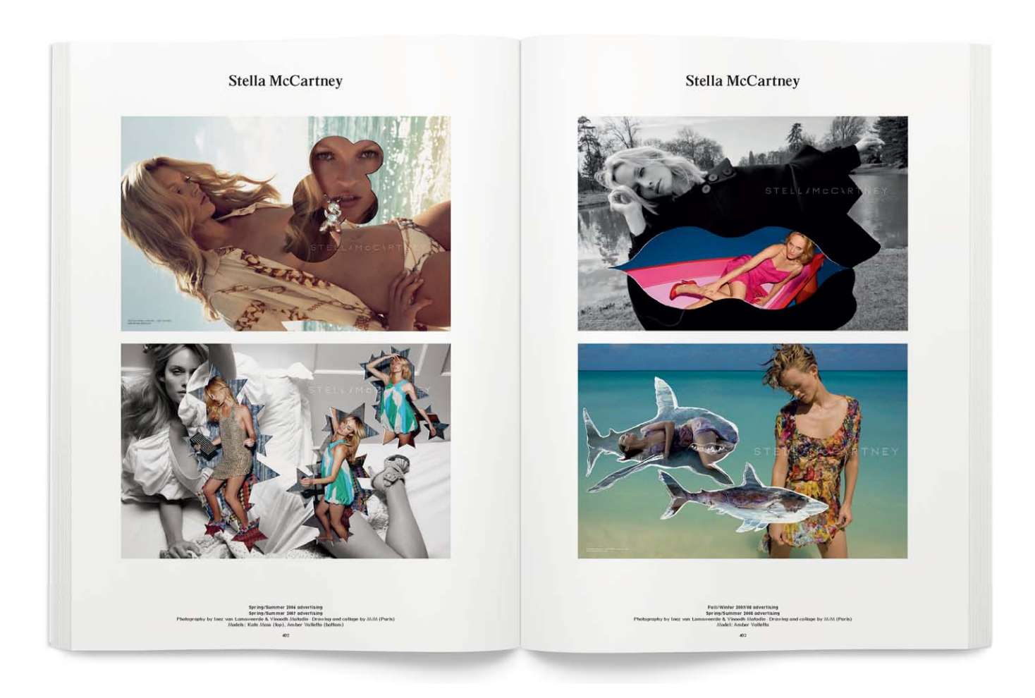
Together with M/M we have four brains. It's much easier than doing something all by yourself. Inez van Lamsweerde & Vinoodh Matadin, photographers