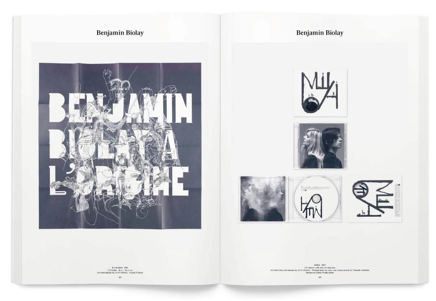
I can't imagine myself with a cover done by an artist other than them. Every time, it's like they give me my finished record. It's like a wonderful gift. Benjamin Biolay, singer