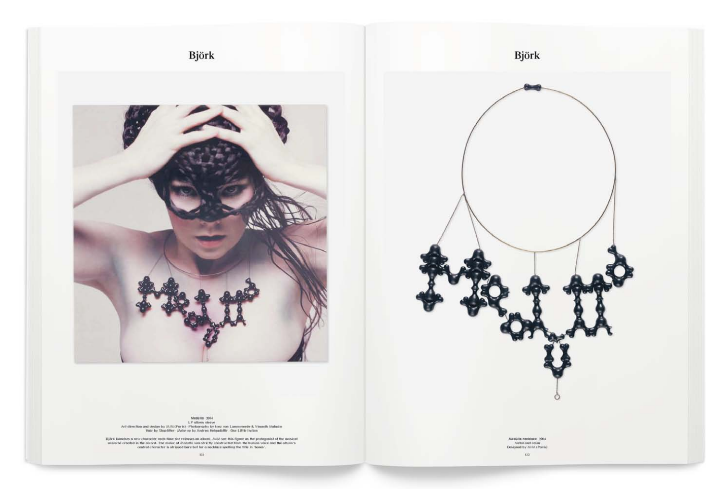
One of the reasons we work so well together is that we don't sit down with bullet points and put down a master plan. It's like the total opposite. Biörk, musician